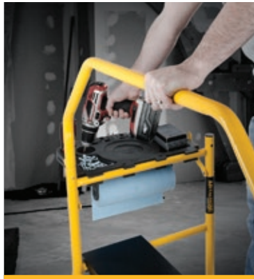
TOOL SHELF & SAFETY RAIL Safety rail to hold on to, for stability. Convenient fold away tool shelf for paint can, bucket, screws, nails and tools.