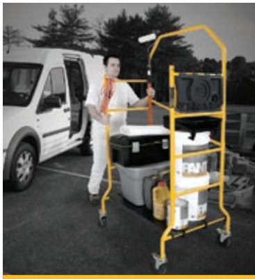
TRANSPORT Use it as a cart to haul your equipment and heavy loads to and from job sites.