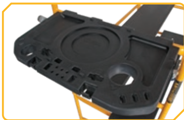
FOLD AWAY TOOL SHELF