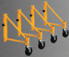
FOR 2 UNITS HIGH