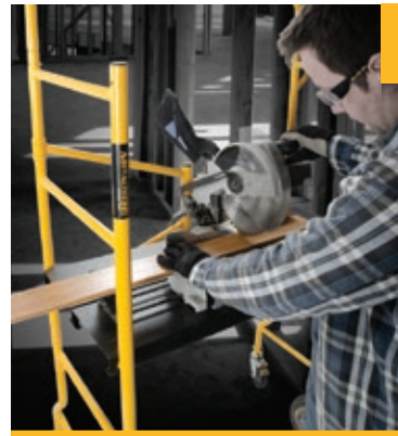
WORKBENCH Multi-level working area. Adjust platforms up to the desired level for a comfortable workplace.